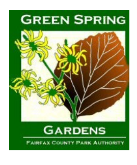
GREEN SPRING GARDENS 4603 Green Spring Road Alexandria, Virginia 22312